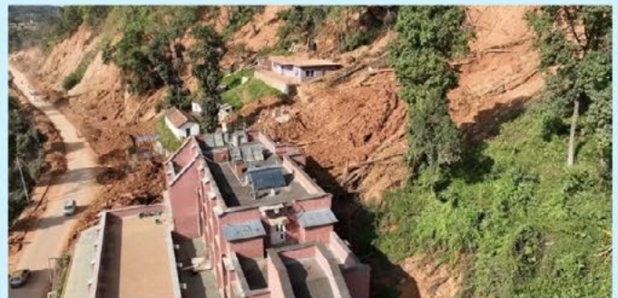
Anandaban Hospital - damage outside (photo above) and inside (photo below)