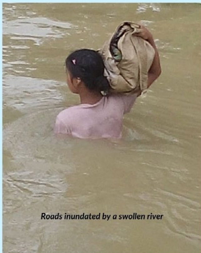
Roads inundated by a swollen river