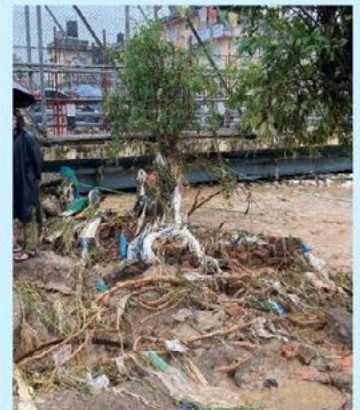
State of roads after flood