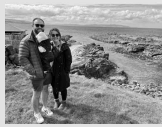
2. If you weren't a curate, what would you be and why?

I am very excited by all that is going on at Christ Church, there is a real depth here and a heart to serve in church and the community. I am looking forward to seeing those develop and to see the things Christ can do in and through us.