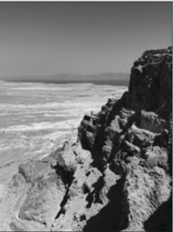
Above: Masada, high above the Dead Sea on the edge of the Judean wilderness.

Day 5 - On to Yad Vashem, the Jewish Holocaust Museum, learning what the Jewish people had to endure. Awful stories. The museum was built in such a way that it represented a triangular tunnel and the further you went, the exit (or light) at the end got bigger and brighter.