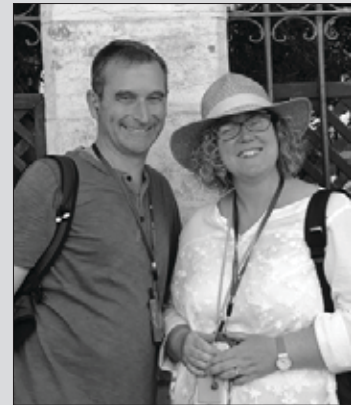
Above: Tourists in Bethlehem.