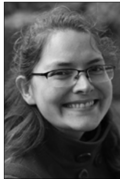
from Sian Woodward