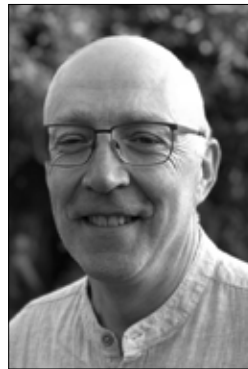
from Martin Dudley

What if they laugh at me or think less of me? What if they label me as a narrow-minded, judgmental, hypocritical Bible-thumper? Or what if they actually come? Then what?